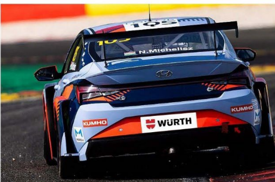
Hyundai Elantra N/i30 Sedan N