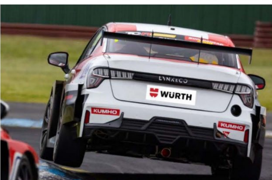
Lynk & Co 03 TCR (Earlier Model)