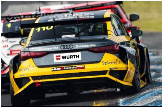
Audi RS 3 LMS TCR (2021)