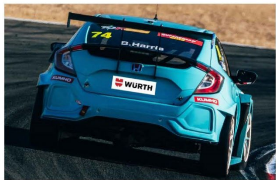
Honda Civic Type R FK7/FK8