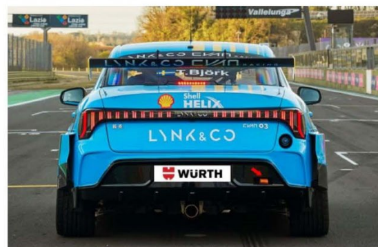
Lynk & Co 03 TCR (Later Model)