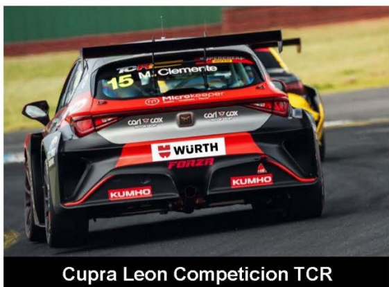
Cupra Leon Competicion TCR