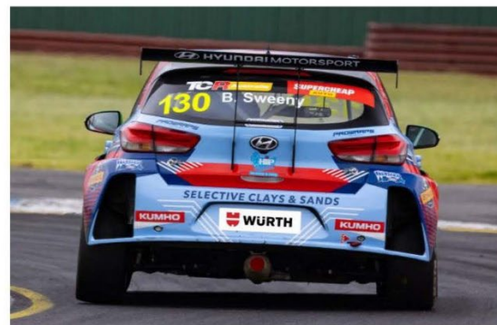
Hyundai i30 N Hatch