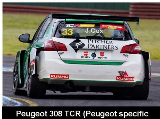
Peugeot 308 TCR (Peugeot specific decal to be supplied - two Würth logos either side of air spike hole)