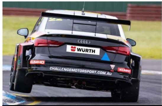
Audi RS 3 LMS TCR (2016)