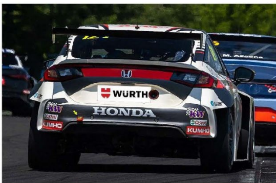
Honda Civic Type R FL5